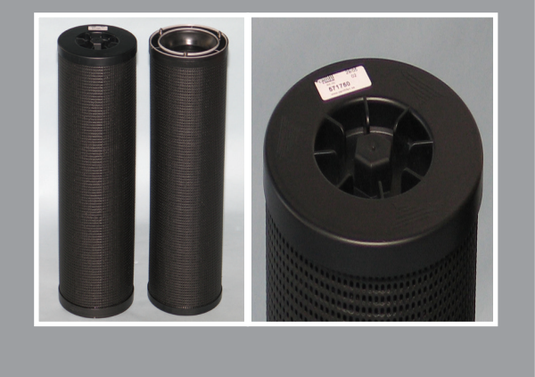
Adsorbent cylinders (available in two sizes) install on frames with a twist, and create tight filter-to-frame seal. A tool is provided that tightens the cylinder to the frame and ensues an air tight seal (see Product Sheet 2112 for cylinder information).

Combines high-capacity sorbent canisters with built-up bank frames for large system gaseous contaminant control